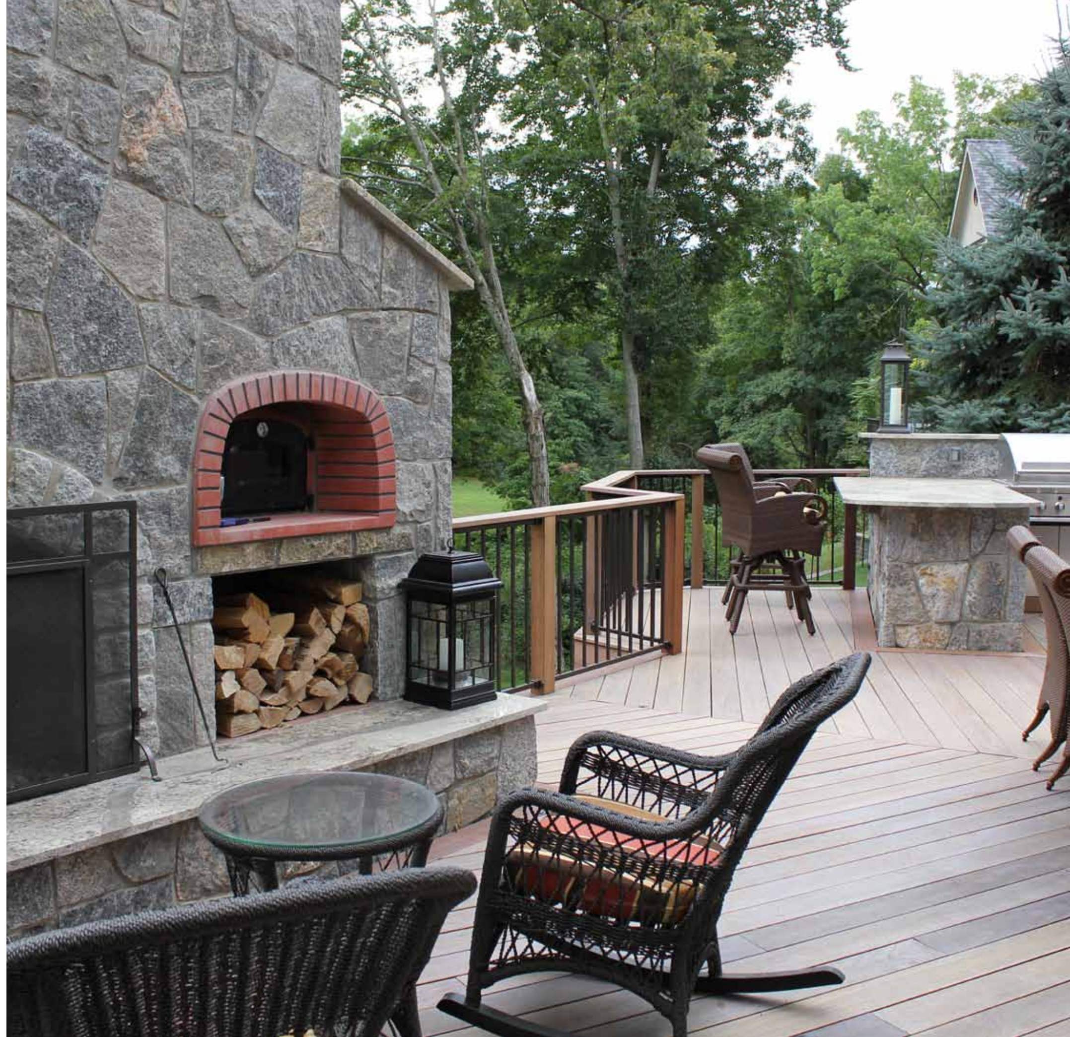
PHOTOGRAPHER: MICHAEL GOTOWALA

FEATURED PRODUCTS Cabinetry: Danver stainless steel Flooring: Opaq decking Countertops: Polished granite Sink: Famer's sink Faucet: Moen Grill: DCS by Fisher & Paykel 48-inch infrared grill Side Burner: Sol-Aire Refrigerator: Summit Lighting: Preferred Properties Landscaping & Masonry Wallcovering: Stone